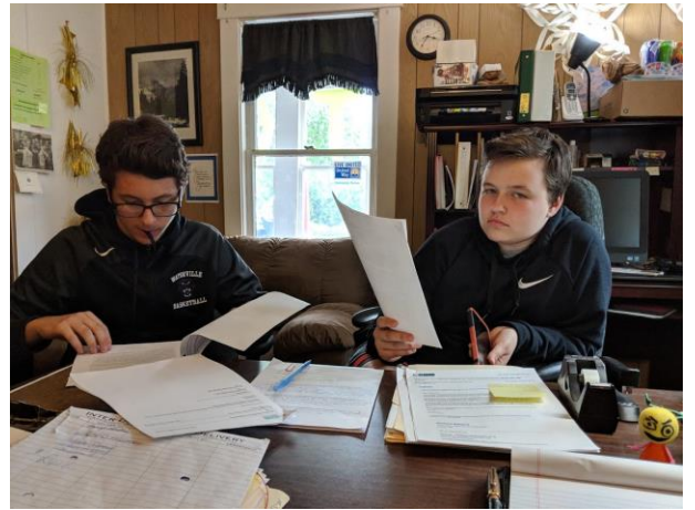
Demo and Colby review applications to see who should be interviewed for a position at the SETC.