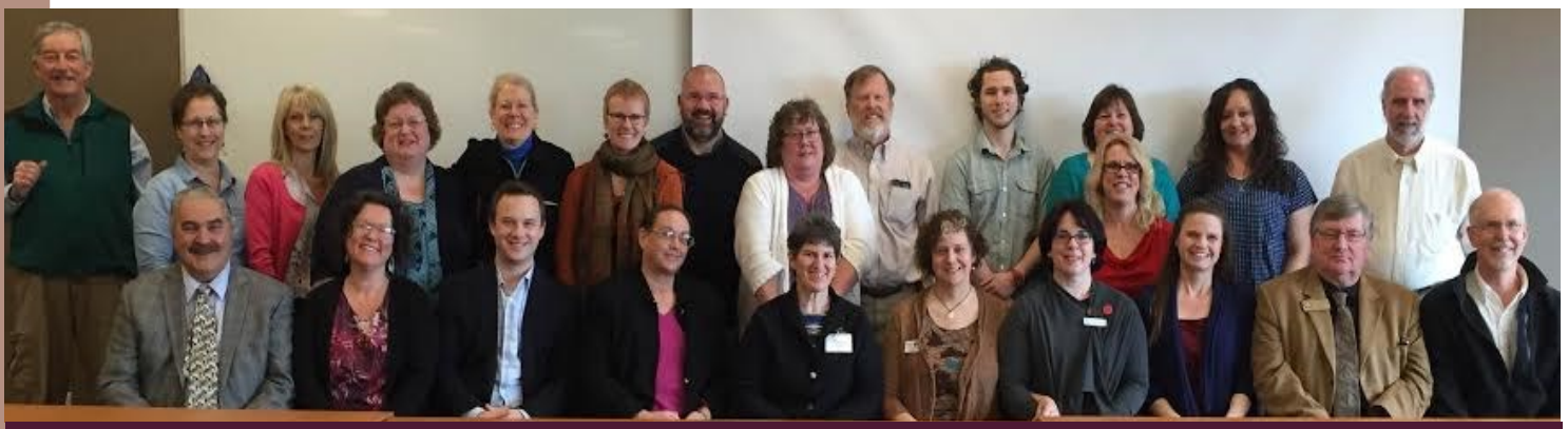
Poverty Action Coalition members and guests at a coalition meeting in April, 2016.

If you are interested in becoming a Community Investor, please send an e-mail to communityinvestors@kvcap.org.