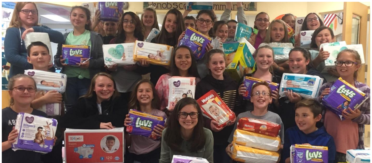
Students from Skowhegan Area Middle School collect 4,000 diapers

36% of mothers living in poverty regularly run out of clean diapers.