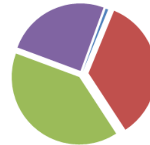
Revenue Breakdown by Department Total Revenue = $19,769,221

■ Agency - 0.62% ■ Child and Family Services - 34.63% ■ Community Services - 39.87% ■ Energy & Housing - 24.88%